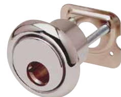
Rim lock cylinders