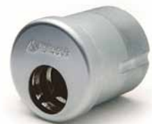
Mortise lock cylinders