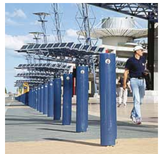
Olympic Park - Homebush