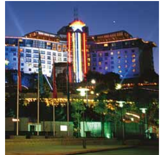
Star City - Sydney