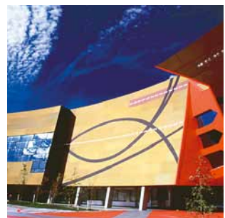
Museum of Australia - Canberra