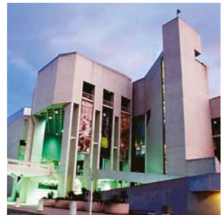
National Gallery - Canberra