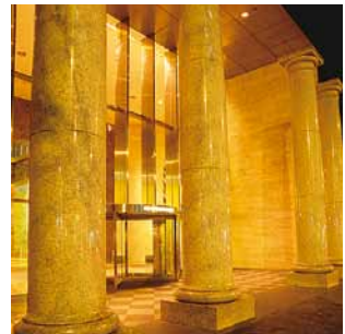
101 Collins Street - Melbourne