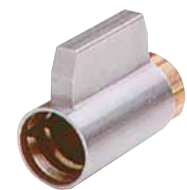
Key in knob lock cylinders