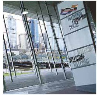
Exhibition Centre - Melbourne