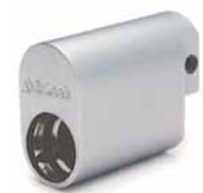
Mortise lock cylinders